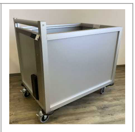
Easy to use & aesthetic