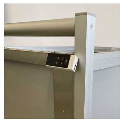
Innovative and cordless