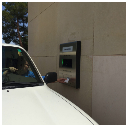
Exterior Drive-up Return

The library has options to enable or disable return features including, but not limited to printing a receipt, receiving an emailed receipt, or declining a receipt during the check-in process. Performance is monitored by LibManager software.