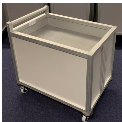
AMH System, sorting into Bins

With the AMH Visualization tool that works alongside LibManager, staff can view the status of the sorter, enabling automatic error detection, and modify the system. The system monitors status changes and displays them in real-time, allows remote maintenance and diagnosis, and provides easy-to-retrieve statistics. Staff can easily define and modify sorting criteria and create multiple sorting profiles, such as accepting or rejecting non-library or non-RFID items and setting special modes for nights, weekends, and holidays.