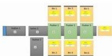
AMH Visualization Tool